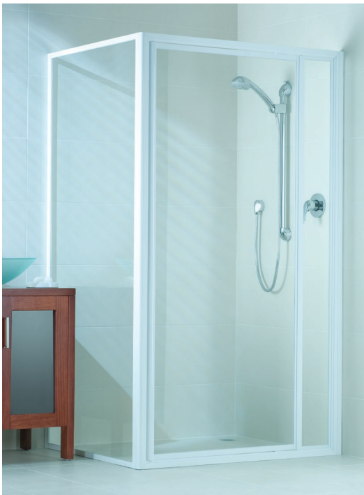
phoenix - fully framed 90° with panel

45° enclosure allows more flexible use of available space. This configuration allows the placement of vanity and toilet on either side of the screen without compromising the door opening.