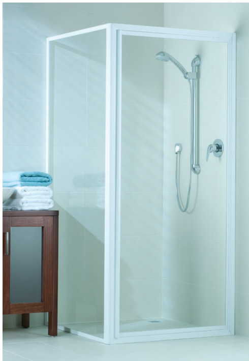
phoenix - fully framed 90°

Bathroom design is a fashion business and our design team continue to expand our range of products, meeting the ever-changing needs of our customers and ensuring that Pivotech products are both fashionable and functional. Using the highest quality materials, our systems continue to be an investment in quality and style. Phoenix shower enclosures are designed with the versatility to adapt to numerous applications and configurations, combined with the ease of installation and quality of components that our customers rely on. Elegance without compromise – designed simplicity.