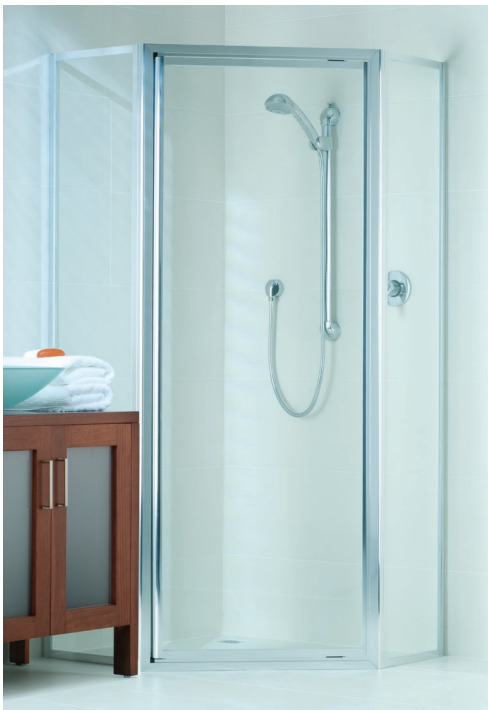
phoenix - fully framed 45°

The Phoenix series represents the ultimate in fully framed shower enclosures. The smooth contoured profile is easy to clean, yet strong enough to provide many years of elegant service.